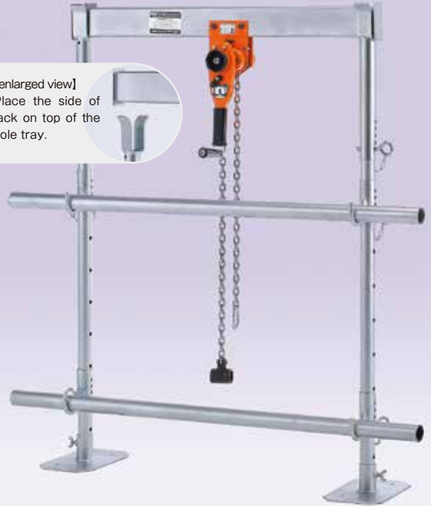
HS-111J *Horizontal pipe is sold separately.

[enlarged view] Place the side of jack on top of the pole tray.