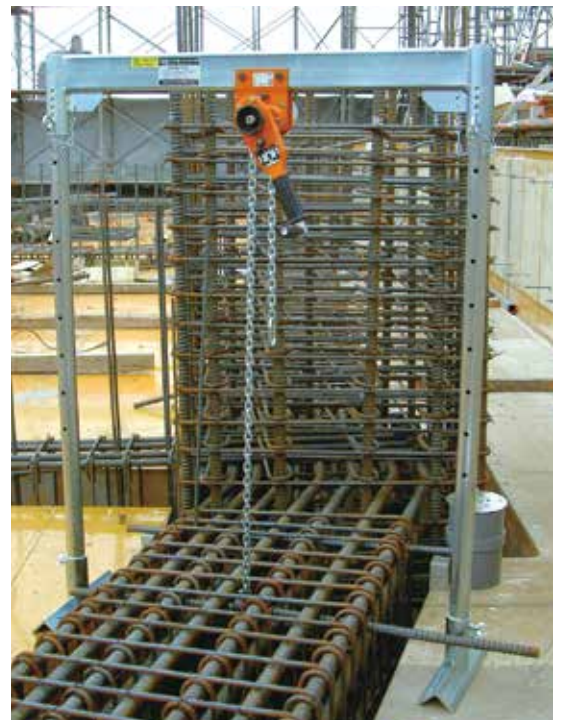
■SPEC Beam Jack