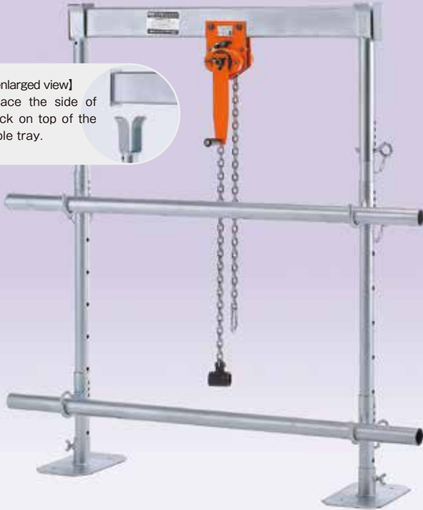
HS-110J *Horizontal pipe is sold separately.

[enlarged view] Place the side of jack on top of the pole tray.