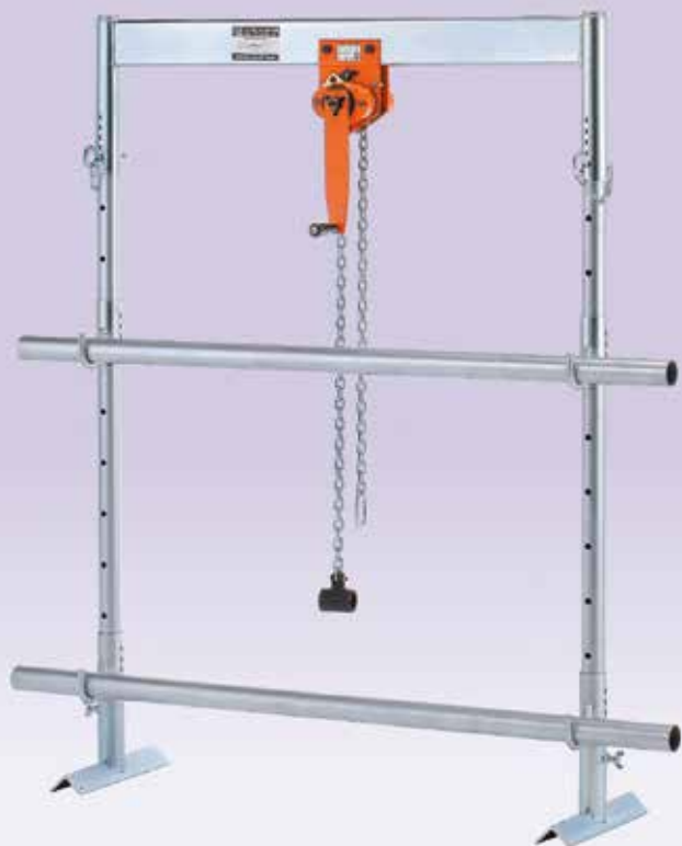
HJN-1100S *Horizontal pipe is sold separately.

HJN-1100S—added a stand function to Beam Jack . (added a hook and horizontal pipe to vertical bar.)