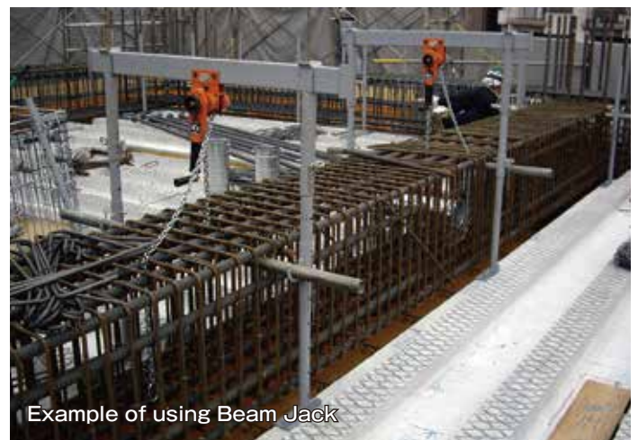
Example of using Beam Jack