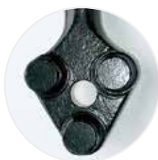
Head of Triangle Handle